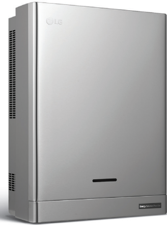
PCS (D008KE1N211) (D010KE1N211)